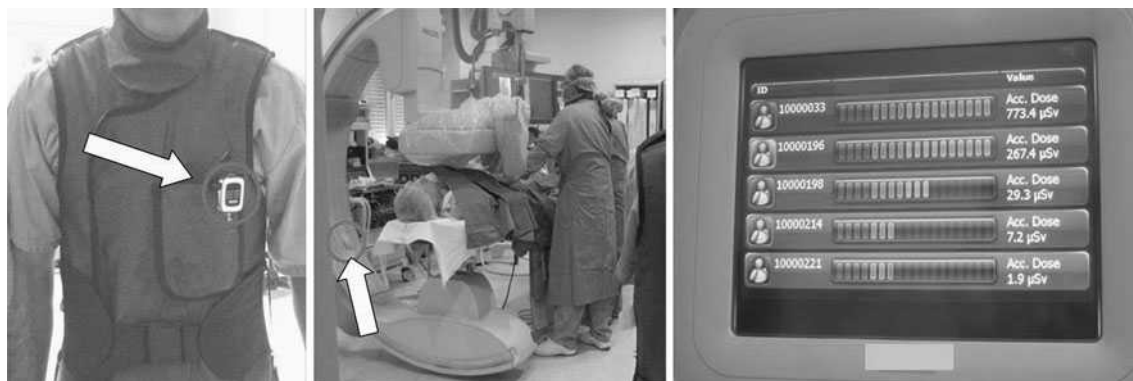
Fig. 1 Detector over the specialist apron ( left ). Detector located at the C arm to have an estimation of radiation dose without protection ( center ). Base station displaying different levels of radiation with a color code

values measured as dose area product (DAP) and occupational doses were analyzed by SPSS software, version 12 (SPSS, Chicago, IL).